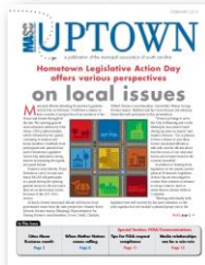
Source: Feb. 2013 Uptown Article "What makes the best government website" From the 2012 Best of the Web Awards

Assess | Improve | Manage Information Technology