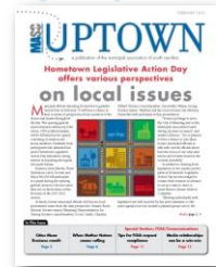
Source: Feb. 2013 Uptown Article "What makes the best government website" From the 2012 Best of the Web Awards

Assess | Improve | Manage Information Technology